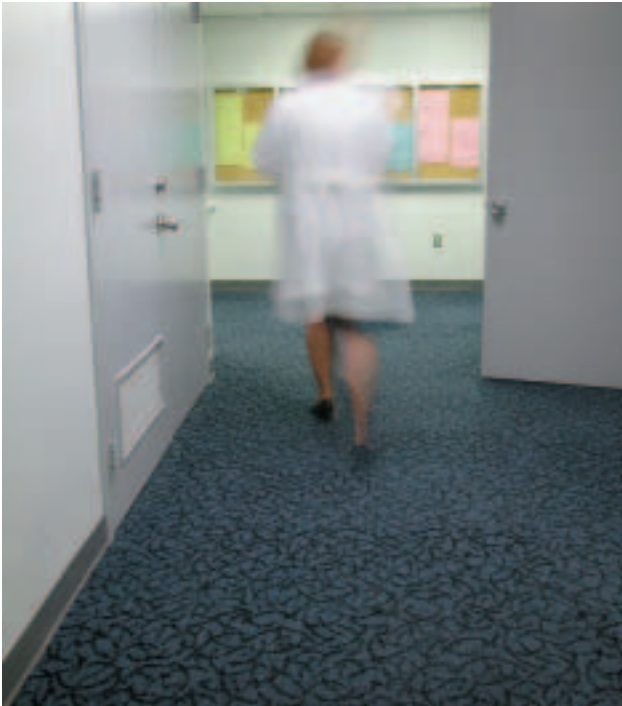
For a busy corridor of the University's Dental School, the facilities and architectural team chose the product Route 66 in the colorway Beaumont .