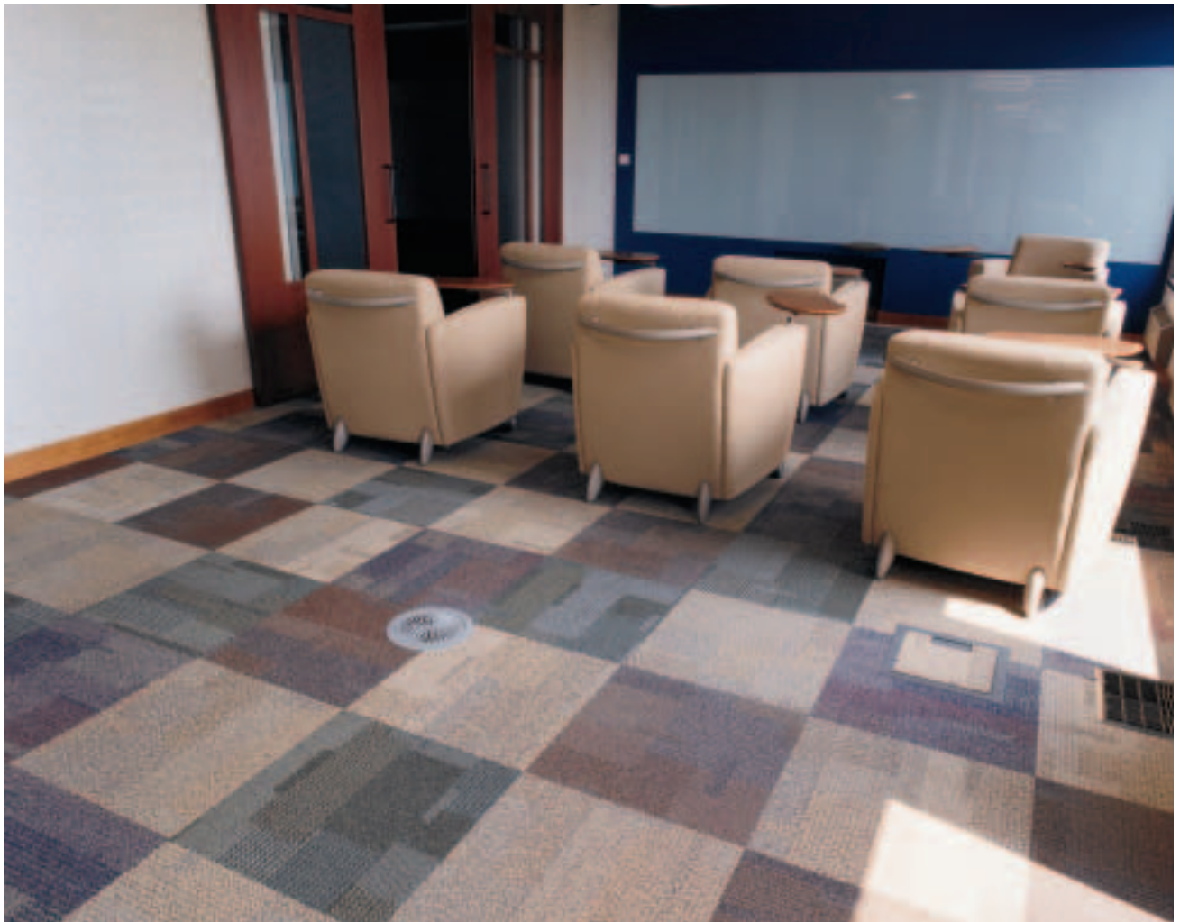
Interface's Entropy modular carpet is used in four different colorways in this training room in the University's Health Science Center.

Products: Route 66™, Analog™, Wabi Weave™ and Entropy®